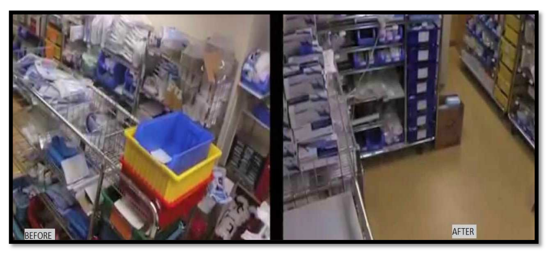
Figure 3: Before and after implementation of 5S, Place 2