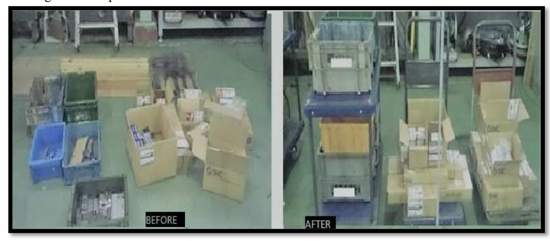
Figure 2: Before and after implementation of 5S, Place 1

The overall productivity of the organization has been increase due to implementation of 5S system. Employees and operations time is saved which was spent in searching the material. Due to proper arrangement of workspace, lots of space is saved and area becomes specious. Detrition of inventory is reduced to certain level due to timely cleaning and visual inspection of material. Due to unorganized area, required material was not getting in time so lots of new materials were procured unwantedly. Proper organization leads to monitory save. Involvement of top management and employees from the ground level has built up the commination channel and boosted their moral values. Changes after implementation of 5S are as follows.