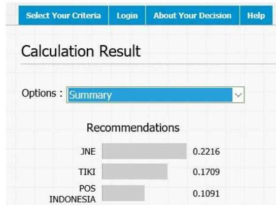
Figure 6. The recommendation produced by the DSS, resulting in JNE and POS INDONESIA with the highest and the lowest score respectively.

To evaluate the usefulness of our DSS prototype, a user survey is conducted using SUS (System Usability Scale) questionnaires whose scoring using Likert scale. Questionnaires distributed to 10 respondents who are potential users for delivery services. The number of respondents is based on John Brooke's (2013) assertion that with a small sample size (8-12 respondents), SUS can produce a good and reliable assessment of how a user views a system. The SUS analysis results show that the average SUS score is 72, which means the system is good enough and usable (Bangor et al, 2008).