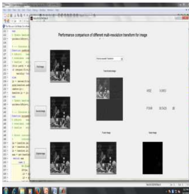
Figure 4. Fusion image with MSE and PSNR

the vertical centering process. Therefore, sub-pattern technique is actually useful to vertical centering process of sub-pattern technique. The vertical centering may benefits for the recognition in varying illumination. Now, we have confirmed this possible forecast and strongly increased the efficiency of the vertical centering process by sub-pattern technique in this paper. From the total experimental results, it can also be seen that for expression variant test, sub-pattern technique and Eigen vector can slightly improve weighted angle based approach classifier, the similarity between a test image and training image is defined as In the weighted angle based approach method cosine measurement.