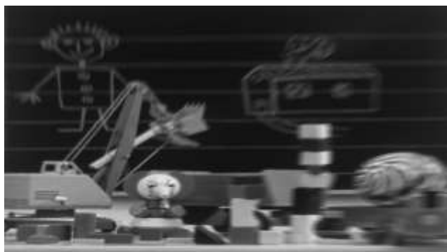
Figure2: First image