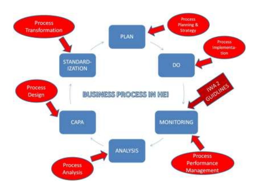
FIGURE 3: Business Process and Quality Management Framework in HEI